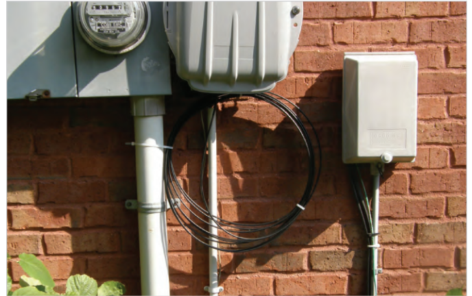
ONT closed with FTTP drop cable loop adjacent

The simplex tight buffer inner cable utilizes bend insensitive single mode fiber and can be tightly coiled without attenuation loss. This functionality allows all excess fiber to be neatly and safely stored within the smallest of conventional ONT enclosures.