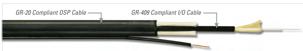
Superior Essex FTTP Tight Buffered Indoor/Outdoor Drop (Series W7)