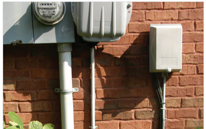
ONT closed with FTTP drop cable inside