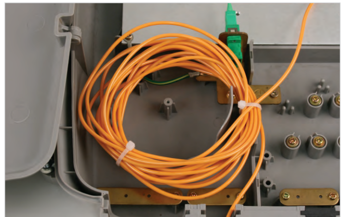
ONT open with drop cable secured and several feet of buffer tube coiled inside

FTTP tight buffer drop cable is an indoor/outdoor cable rated at -40 C to +65 C. It is available with or without a toneable element. It is available with a MDPE jacket or an OFNR-rated PVC jacket. The cable meets GR-20, PE-90 and is listed on the RUS/RDUP website.